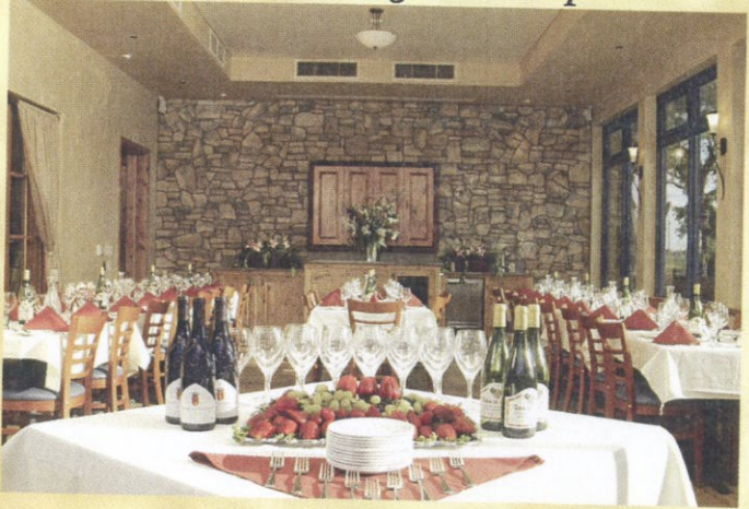
Private dining room ideal for intimate weddings and receptions